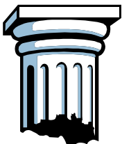
Figure 1 – Capital from ancient Greece.